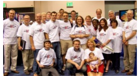
OneByOne and Outpost at PCUSA